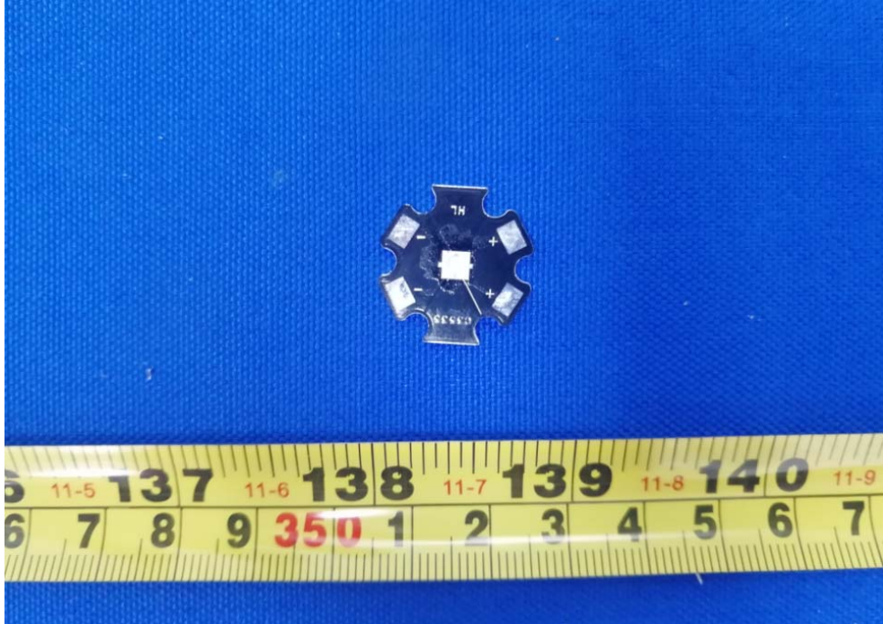
EUT - The overall view